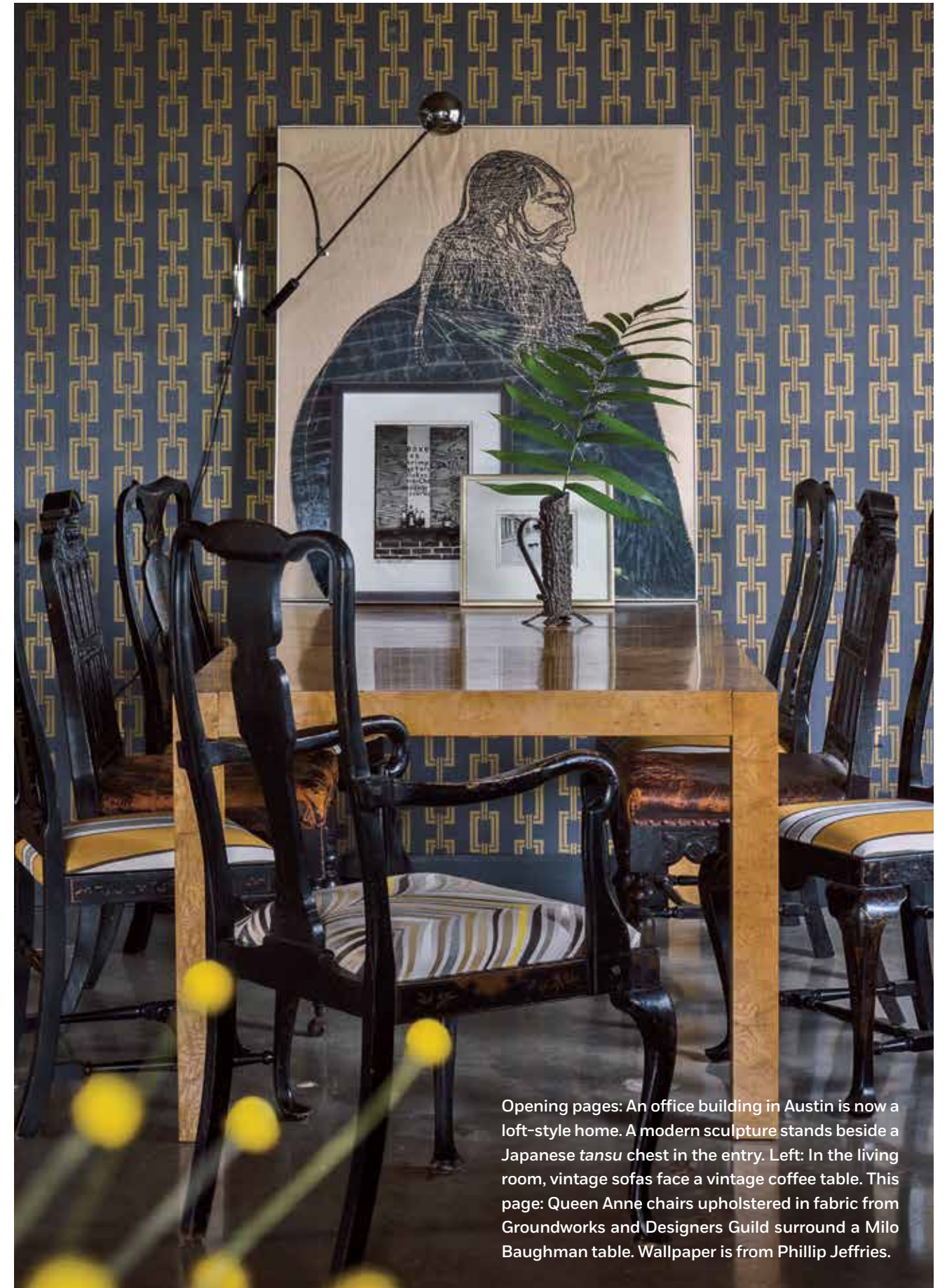
Opening pages: An office building in Austin is now a loft-style home. A modern sculpture stands beside a Japanese tansu chest in the entry. Left: In the living room, vintage sofas face a vintage coffee table. This page: Queen Anne chairs upholstered in fabric from Groundworks and Designers Guild surround a Milo Baughman table. Wallpaper is from Phillip Jeffries.